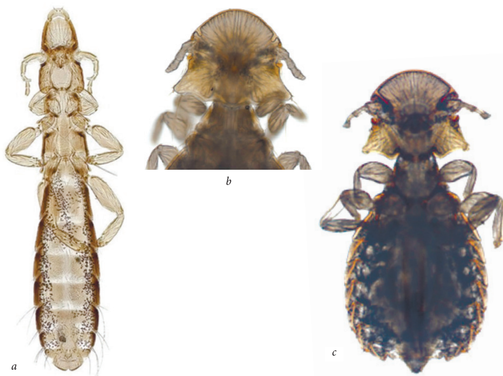
Fig. 1. Fam. Philopteridae: a — Columbicola columbae — general view; b — Companulotes compare — head; c — Companulotes compare — general view.

parasites are mainly localized nearer to the skin covering, they can also be found on accessory feathers and abdomen areas covered with down. They feed on down or lymph and blood. B. columbae is distinguished by considerable chitinization of the head and lateral parts of the thorax. This species is more mobile than the former one and differs from the other species by pale coloring. The degree of pigmentation somewhat increases on the head, feet, and on the tip of the abdomen. Despite their active movements, it is difficult to notice them among feathers. B. colombae differs from the other found species by a small head with prominent clypeus, and also the different shape and length of antennae. Their feet are thin and long.