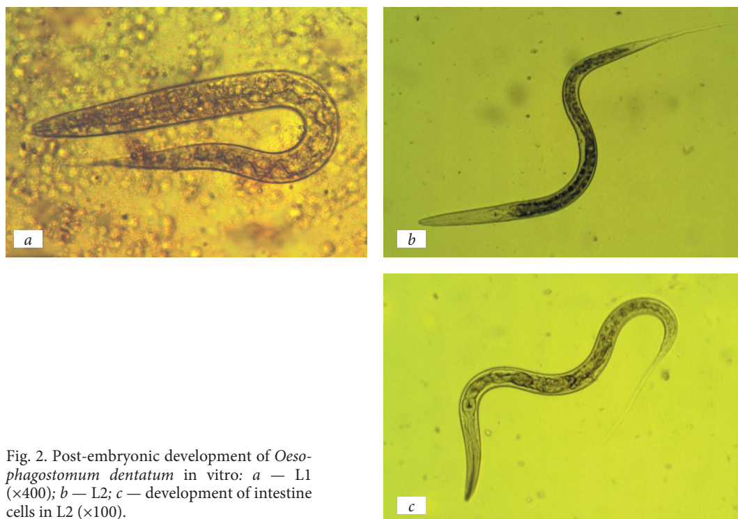
Fig. 2. Post-embryonic development of Oesophagostomum dentatum in vitro: a — L1 ( \times 400 ); b — L2; c — development of intestine cells in L2 ( \times 100 ).

the development and hatching of L1. On the third to seventh days, intense formation of L2 (12–67 %) was detected. At that time, 27 % of larvae died, 5 % of eggs stopped developing. On the eighth to tenth day, L2 formation was observed (50–63 %); 5 % of embryonic and 32 % of post-embryonic O. dentatum died simultaneously.